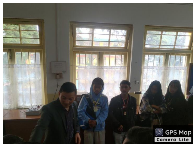
GPS Map Camera Lite HV9W+5V3, Laitumkrah, Shillong, Meghalaya 3, India Latitude 25.56763883° Longitude 91.89680985° Local 03:21:19 PM Altitude 1542 meters GMT 09:51:19 AM Monday, 06.03.2023