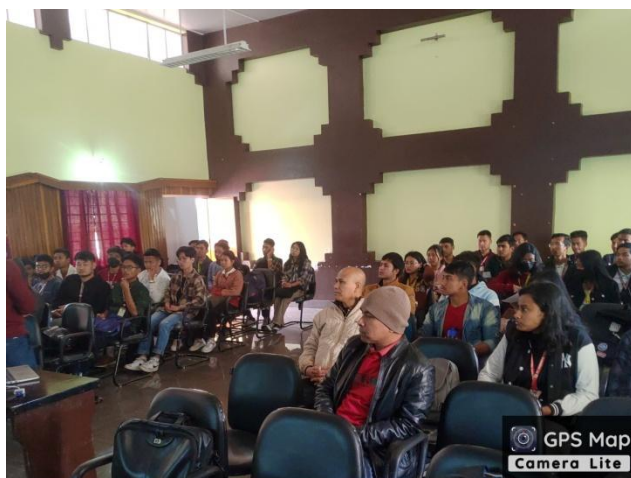
GPS Map Camera Lite HV8W+RMR, Laitumkrah, Shillong, Meghalaya 793003, India Latitude 25.56745951° Longitude 91.89689307° Local 01:33:04 PM Altitude 1549 meters GMT 08:03:04 AM Monday, 06.03.2023