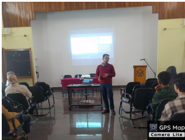
GPS Map Camera Lite Latitude 25.56718698° Longitude 91.89689524° Local 01:32:02 PM Altitude 9.11 meters GMT 08:02:02 AM Monday, 06.03.2023

The students actively participated in the event, they interacted with the scientists, posed many questions, had a live visual of plasma and were enthusiast to know about the diverse career opportunities in the field of plasma.